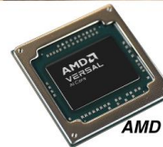
AMD Versal AI Core